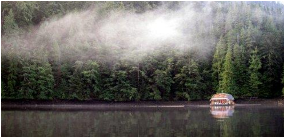
Floating Lodge accommodation Gwaii Haanas.