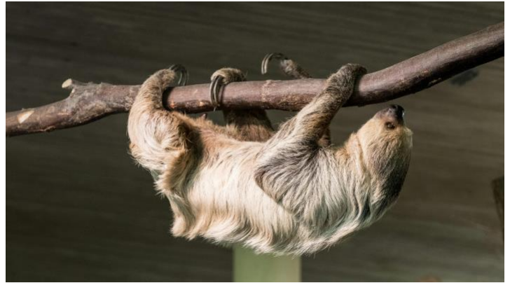
LAMS 1102 Trouble In Paradise