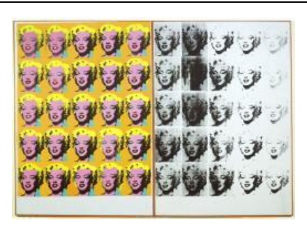
Figure 1. Andy Warhol, Marilyn Diptych , 1962, acrylic paint on canvas, 2054 x 1448 x 20 mm, Tate Modern, London, http://www.tate.org.uk/art/artworks/warholmarilyn-diptych-t03093.

Note: Do not include a Bibliography if a credit line is given in the body of the text; See note above.