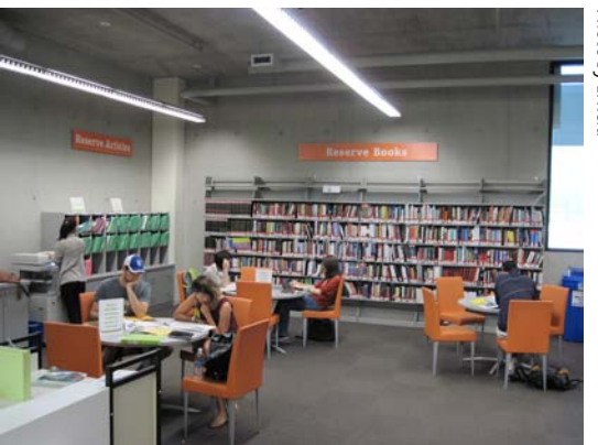
Reference and Reserves Area