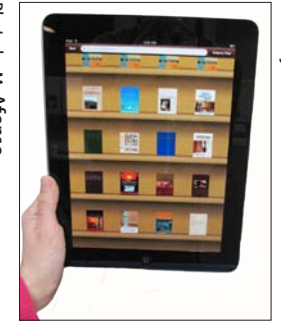
Gary Kalmek roves with iPad