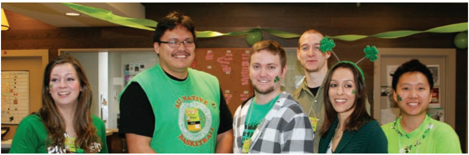
Top: This group partnered with local sports and cultural organizations to give over 100 children in the Tri-Cities area a chance to try out five new activities, including Zumba and button-making! Bottom: This group organized a St. Patrick's Day Photo Scavenger Hunt all over downtown Vancouver for youth from the Covenant House.

The Recreation Program Planning class (RECR 1168) had the recreation students creating, planning, and implementing special events in partnership with local community recreation agencies. The students put a lot of time, energy, and heart into their projects, and it was wonderful to see their learning and program planning theory come to life as these high quality recreation events came to fruition.