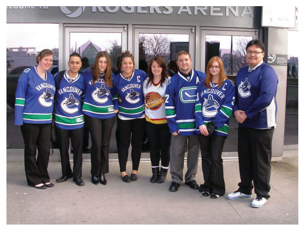
The first-year diploma students wore a variety of Canucks jerseys during their second term tour of Rogers Arena in Vancouver.

During their second term of study (January to April) the first-year students were kept very busy. Included in this term were courses in Recreation Program Planning, Personal Portfolio Development and Seminar, English or Communications, Applied Psychology, Valuing Diversity in Leadership, and Applied Skills in Recreation Operations. Supplementing the "in the classroom" material for the operations course were a number of field trips to major facilities in the Vancouver area. These included Mount Seymour, Shaughnessy Golf and Country Club, Rogers Arena, and Queen's Park Arena in New Westminster for the 25th annual Recreation Students' Custodial Lecture and Competition.