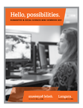
HUMANITIES & SOCIAL SCIENCES