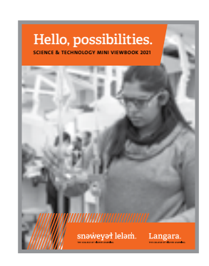
SCIENCE & TECHNOLOGY