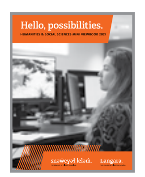
HUMANITIES & SOCIAL SCIENCES