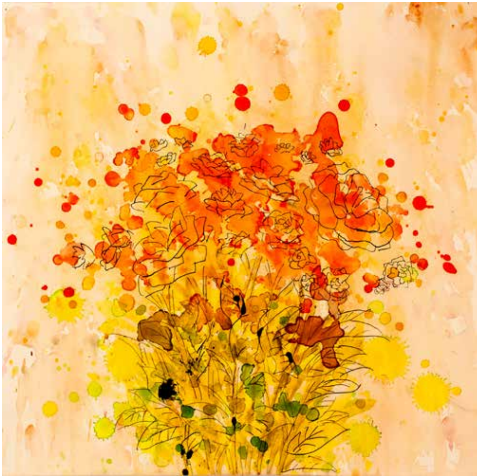
Kyung Min Im