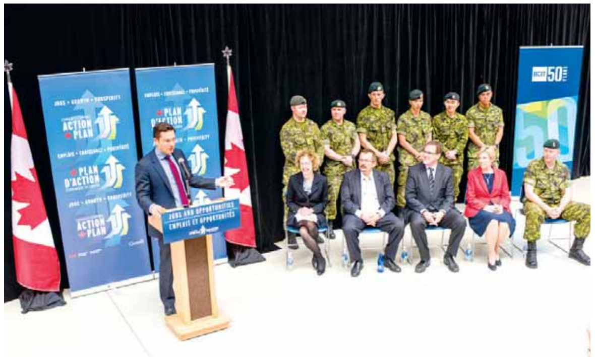
Funding from the federal government will allow the British Columbia Institute of Technology (BCIT) to launch the National Advanced Placement and Prior Learning Program (N-APPL) for military veterans.