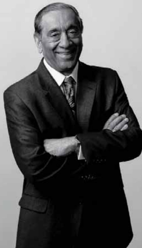
Former British Columbia attorney general Wally Oppal was recently named an honorary fellow by Douglas College, the school's highest honour.